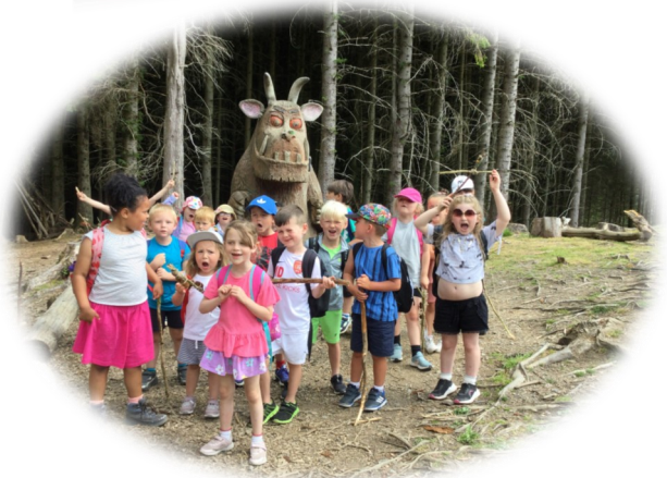
YEAR 1 — WHINLATTER