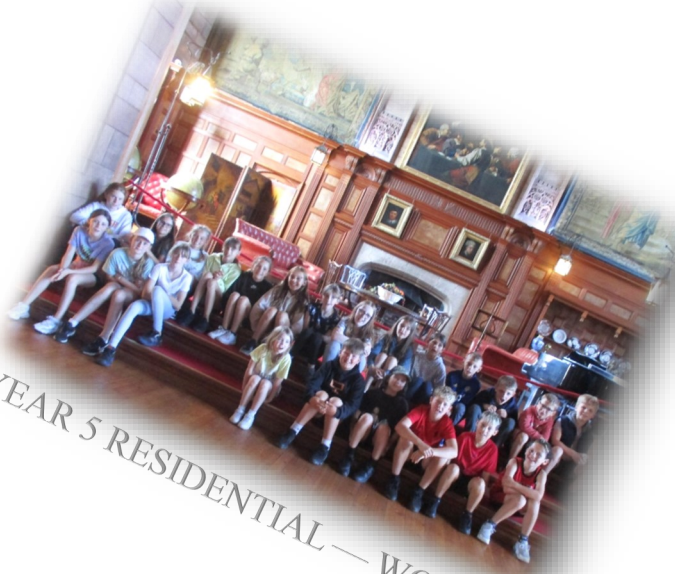
YEAR 5 RESIDENTIAL — WOOLER