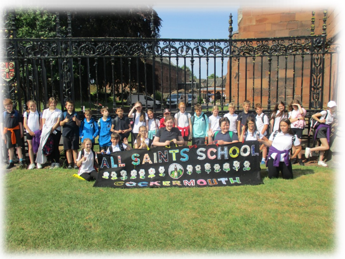
YEARS 6 LEAVERS SERVICE CARLISLE CATHEDRAL