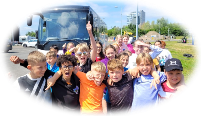
YEAR 6 RESIDENTIAL — GLASGOW