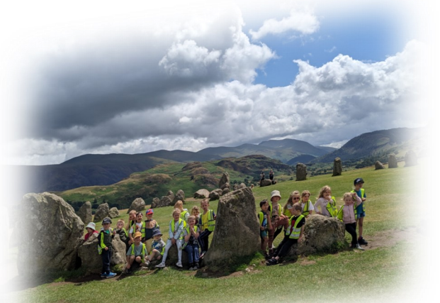
RECEPTION—ROOKERY WOODS & CASTLERIGG STONE CIRCLE