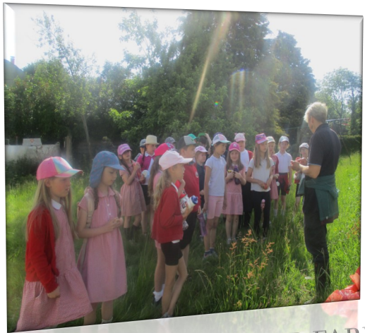
YEAR 3 — LOW STANGER FARM